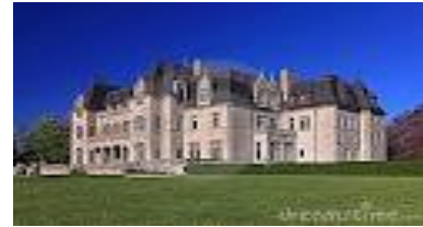
Salve Regina University

Seniors should make every attempt to visit those colleges they are seriously considering attending. Even if students have already visited, the more times they visit, have connection with the colleges, the more it is looked favorably upon by the admissions counselors.