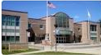
Rhode Island College